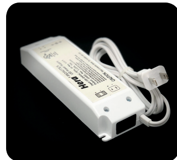
Daisy Drivers ◦

Hera's constant voltage electronic driver is available in multiple wattages. Being able to daisy chain one driver to the next means you can install up to 1120' of LED to one quad outlet.